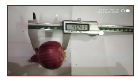
Fig. 3. Thikness (T).