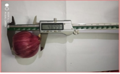
Fig. 1. Polar diameter (D_p) .