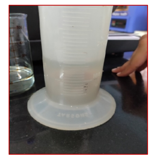
Fig. 5. Measuring true density of onion bulb by using toluene.