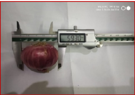
Fig. 2. Equatorial diameter (D<sub>e</sub>).